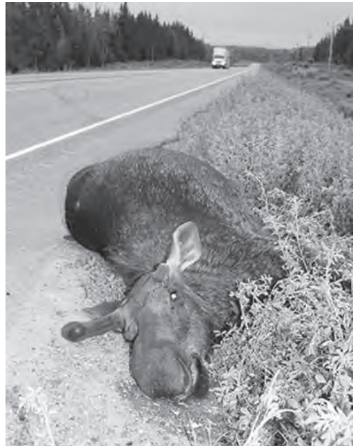
Figure 1. Collisions with Moose continue to be a serious threat to the motoring public in many parts of northern BC. Highway 16 east of Vanderhoof, BC. June 2003 (Roy Rea).

we have modified a road safety device that utilizes Global Positioning System (GPS) technology to capture date, time, and location using specifically designed waypoint buttons for deer ( Odocoileus spp.) and Moose ( Alces alces ), which are the most commonly observed large animals on roads in northern BC. Ten units are currently deployed in trucks that ferry goods back and forth along designated routes in northern BC several times a day. When a truck driver observes a Moose or deer in the road corridor, he or she depresses the appropriate button to record a waypoint of that animal. If the deer or Moose observed is dead, the trucker depresses a "dead" button on the unit quickly after selecting the Moose or deer button. Location, date, and time of day as well as species and whether or not the animal is dead are recorded in the unit's memory. Twice per month, data are downloaded by company dispatchers and e-mailed to our research team at the University of Northern BC where it is uploaded into GIS mapping